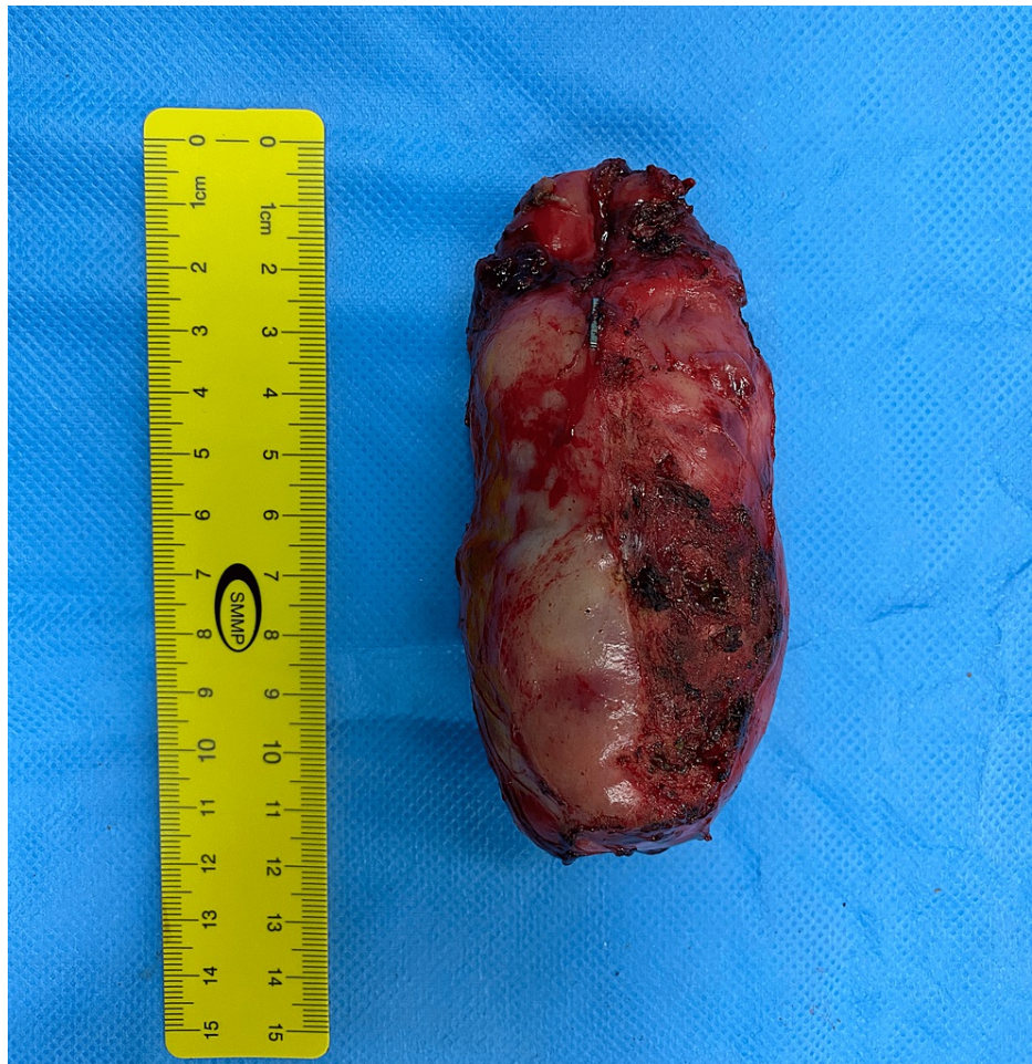
FIGURE 2: Excised gallbladder specimen