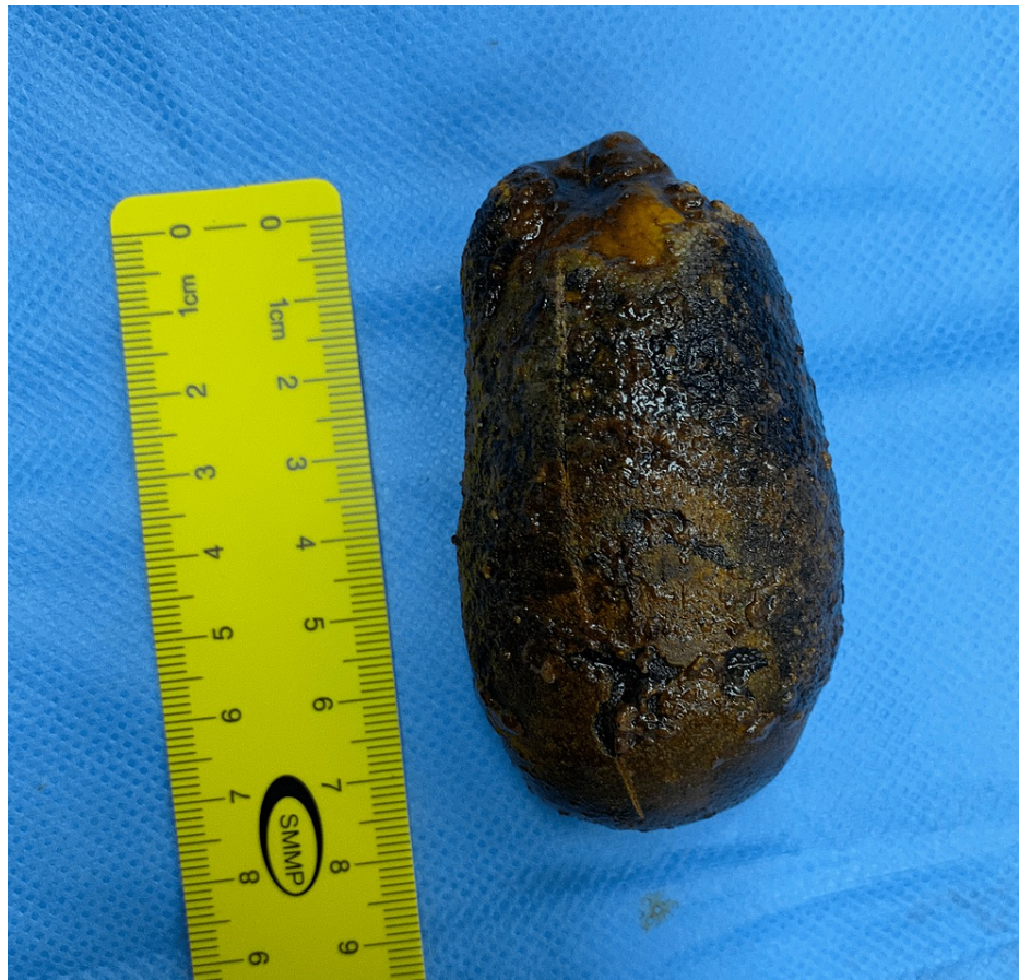
FIGURE 3: Giant gallstone measuring 8.7 cm in length.