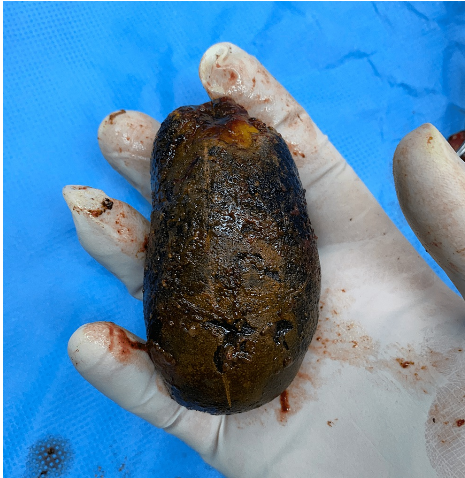
FIGURE 4: Giant gallstone held in surgeon's hand

The postoperative course was uneventful and the patient was discharged on the second postoperative day. The histopathological report showed features of acute on chronic follicular cholecystitis and no evidence of malignancy.