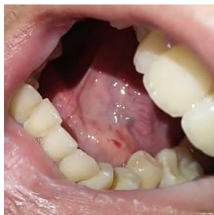
Fig. 3. Clinical photography showing petechia of the buccal mucosa.