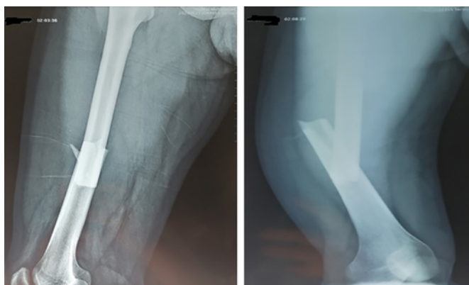
Fig. 1. Standard X-ray imaging of the right thigh in antero-posterior (left) and lateral (right) views showing a displaced transverse fracture of the right femoral shaft.