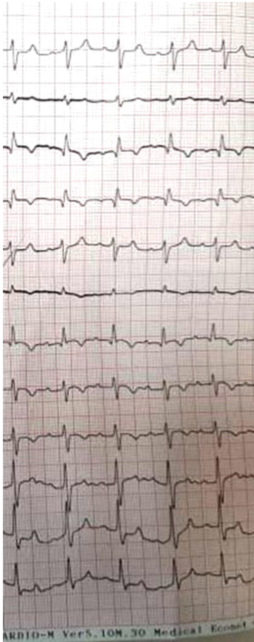
Fig. 2 – The electrocardiography of the patient.

The patient had no recent hospitalization records, immobility, or other acute pulmonary embolism risk factors. Therefore, it seems that the main culprit of the thromboembolic event in our patient was the COVID-19 infection. The diagnosis of the novel coronavirus infection coincided with embolism, making the condition more complicated for administering prophylactic agents for thromboembolism.